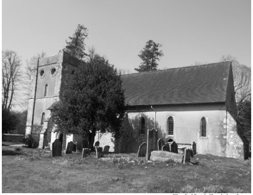
Warnford Parish Church