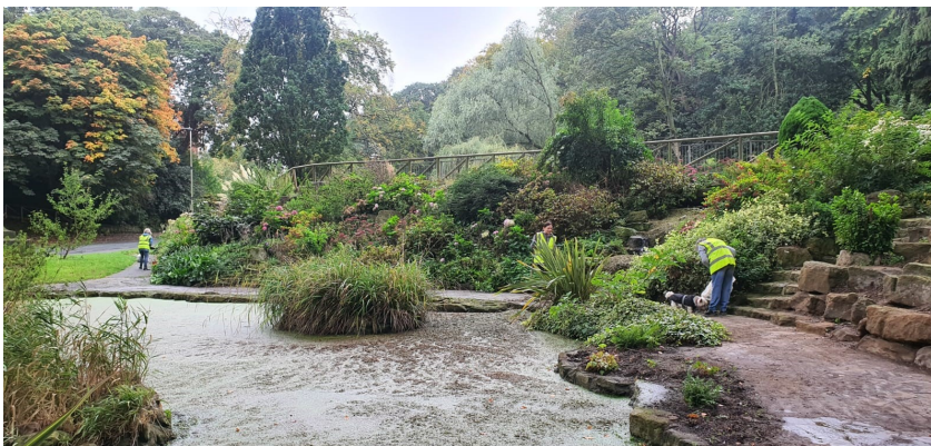
Clearing the area around the Mill Pond

But we did have a very productive session on 8 October focusing on tidying up the area around the Mill Pond, resulting in 6 full bags of garden waste. The litter pickers did their bit too collecting a fair amount of rubbish, including clearing rubbish from inside the Ice House.