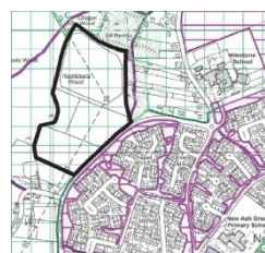
Land North of Chapel Wood