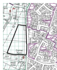
Land West of Chapel Wood

Firstly, for around 175 units opposite the Royal Oak Pub and a proposal for 580 houses covering 116 acres south of New Ash Green on Ash Place Farm land.