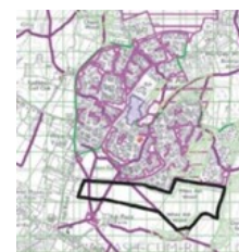
Ash Place Farm

There will be an opportunity to comment on these plans in the future and the details will be published in the Bulletin so anyone who wishes, can have their say.