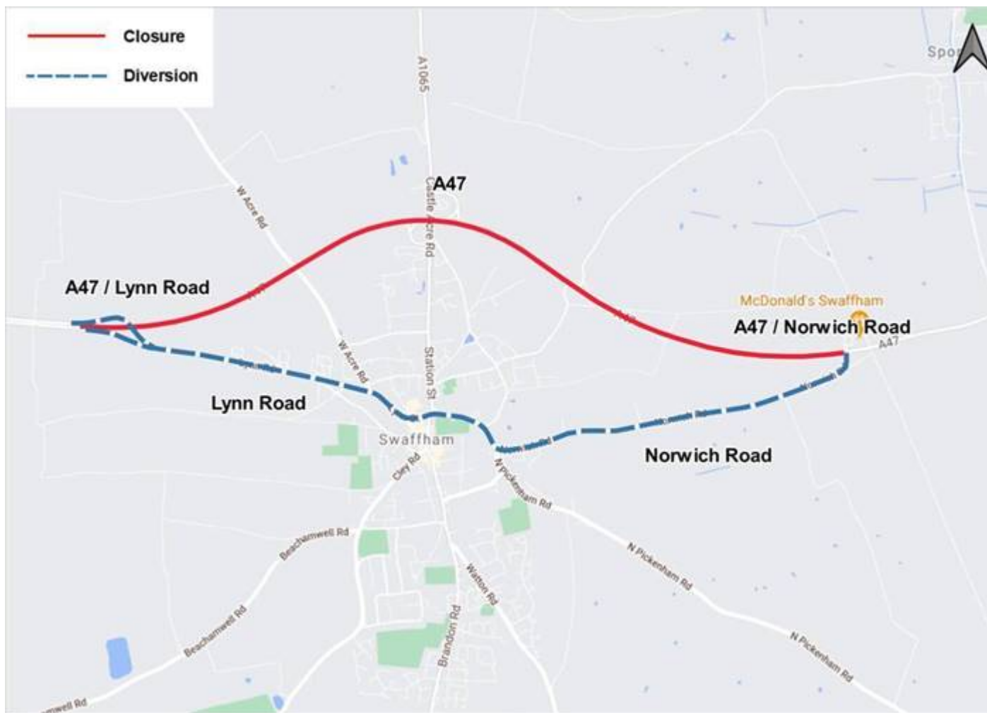
Swaffham Eastbound Exit Slip