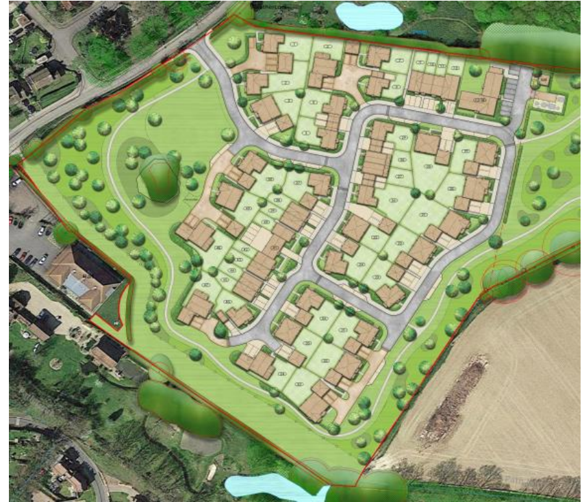
Site Layout as submitted

The planning application was submitted on the 13 th April 2018 and will be available to view on ABC's website in due course.