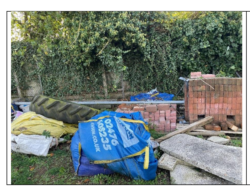
Image 4: Building supplies – used for projects across our site/stored at the allotments