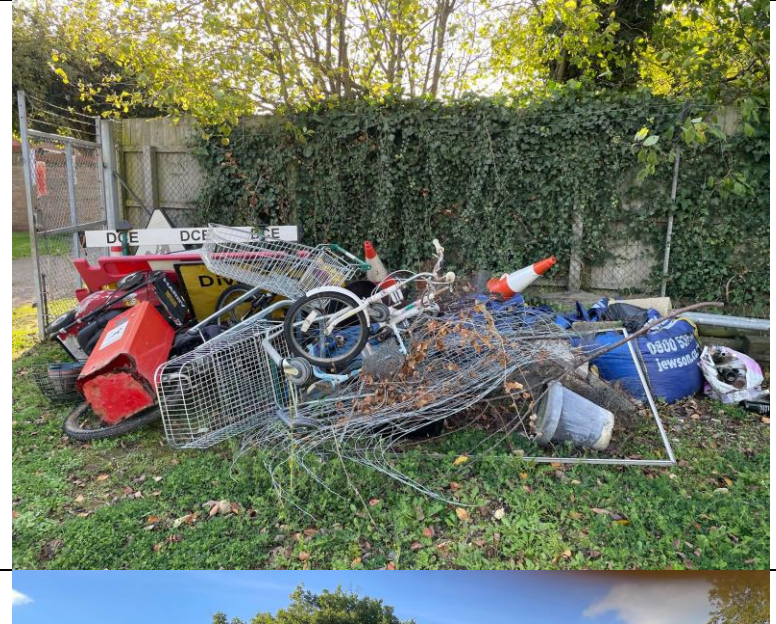
Image 1: Items picked up at the lake and other BPC sites across the parish and periodically disposed of.

Below are images of waste/items near the entrance of the allotment site.