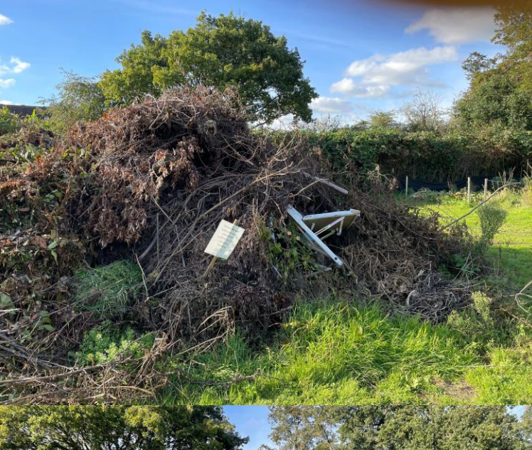
Image 2: Bonfire waste. Green waste not suitable for the compost pile.

Image 1: Items picked up at the lake and other BPC sites across the parish and periodically disposed of.