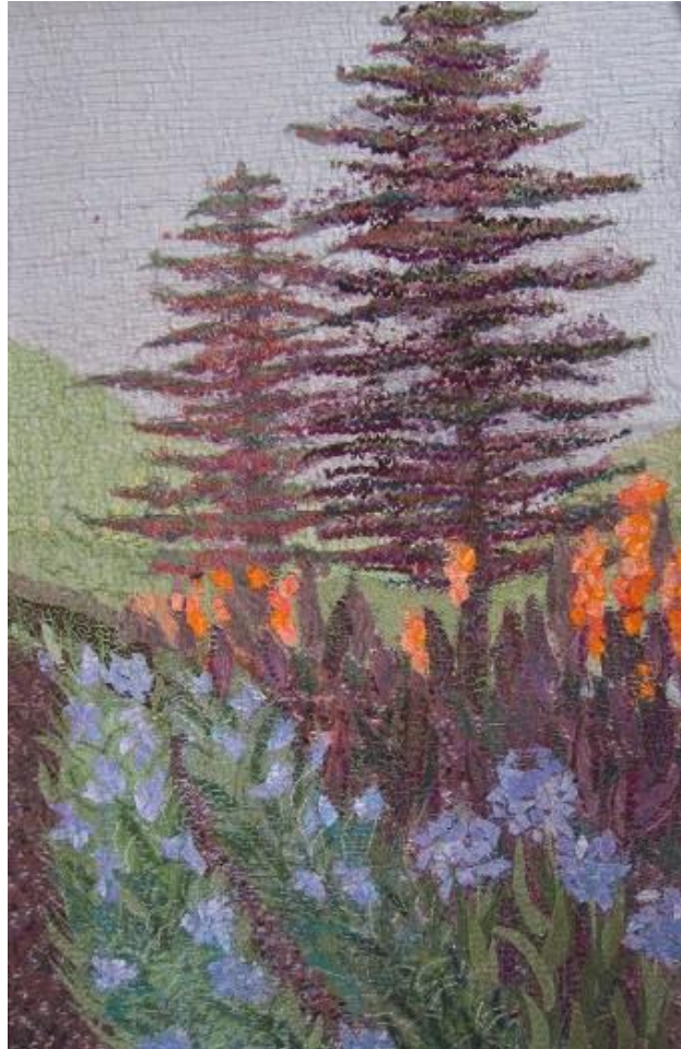
The Eden Project

Opening times vary so please check web site for details.