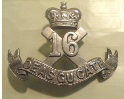
Right: 16 th Battalion Canadian Regimental cap badge. Motto: Deas Gu Cath 'Ready for the Fray'