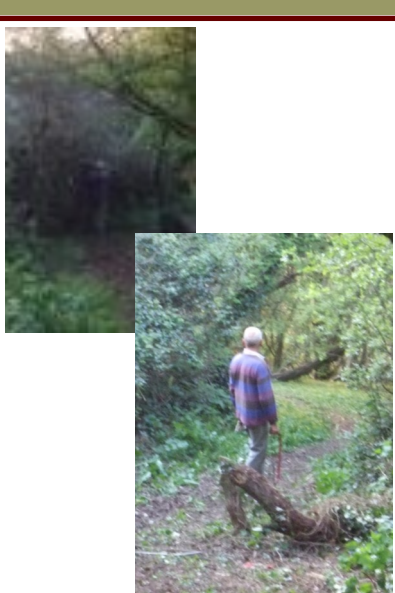
A fallen tree blocking a path. Jon is in there somewhere. What a difference, half an hour later.