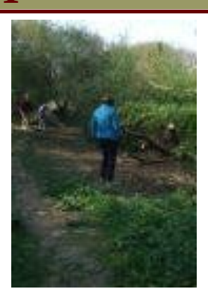
Opening up the pathway to allow more light in and help with drainage.