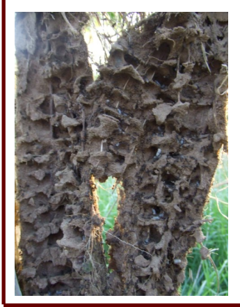
This ants nest was built around one of the young trees in Coopers Wood.

We did not disturb this nest and the parent birds returned shortly after we found it.