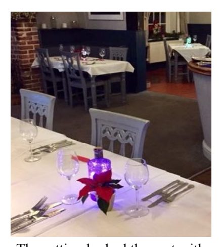
The setting looked the part with table cloths and festive table decorations too.