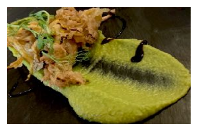
Vegan Battered Banana Blossom