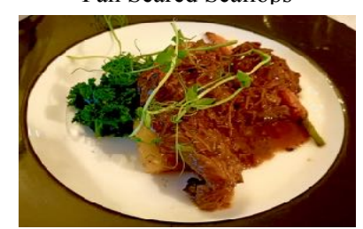
Slow Cooked Beef Chuck