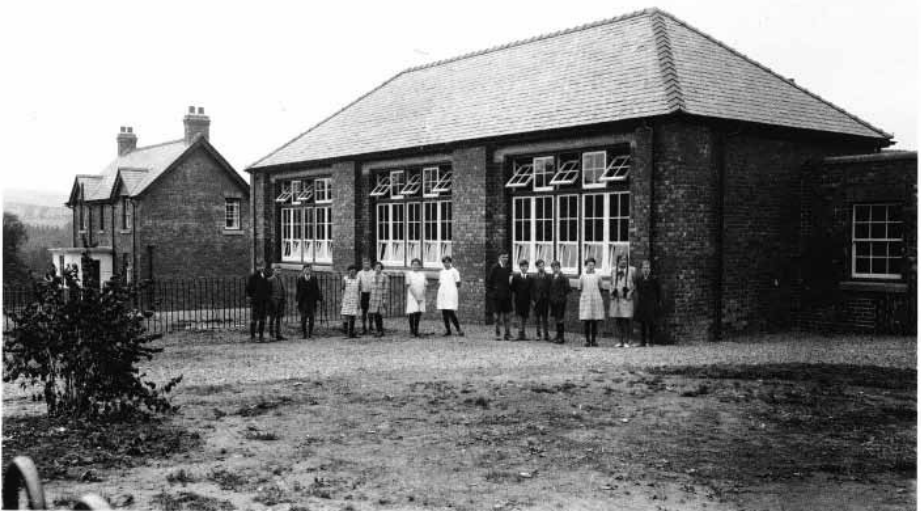
Llanbister School, Radnorshire