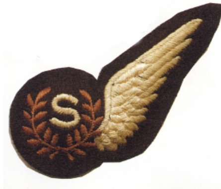
Wireless Operator's "half-wings" - "S" for signals