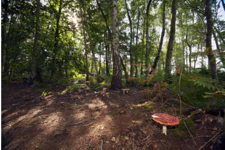
Fungi and plants share extraordinary underground networks

The damp conditions of autumn make it the ideal time for fungi enthusiasts.