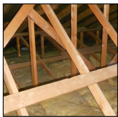
Energy Performance Cer tificate (EPC) rating of E, F

Residents who meet these criteria should phone Wealden's Home Energy Efficiency Officer on 07985 878631 to find out more.