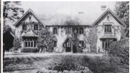
Left, the family in the garden of Leeford (pictured above)

Young voices return to Leeford – next page