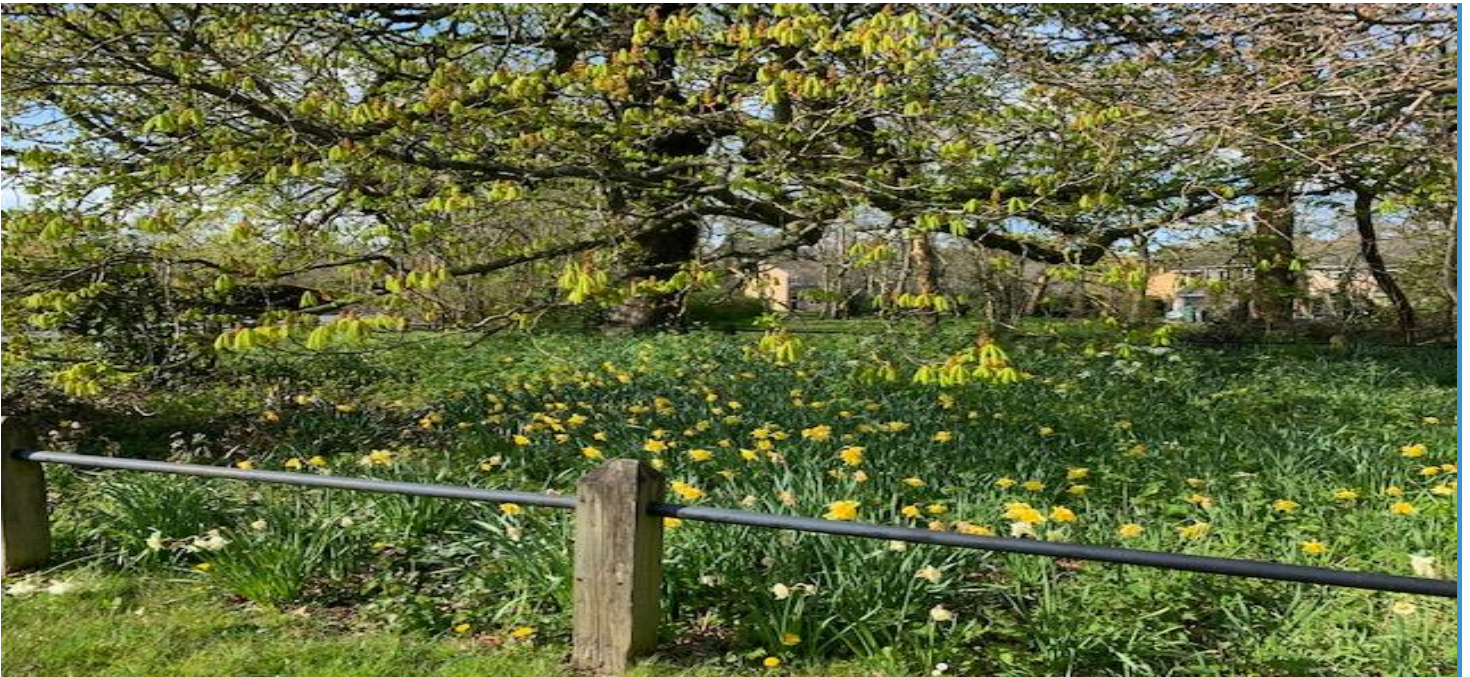
Poplar Corner, April 2021