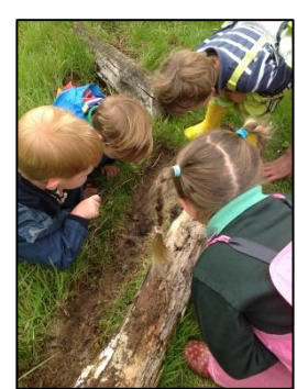
"Look - a toad!"