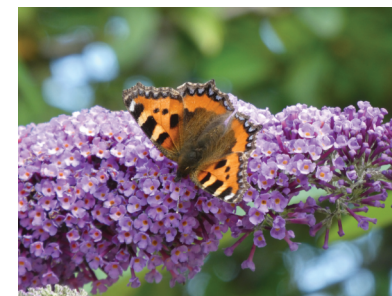
Small tortoiseshell butterfly feasting on buddleia nectar

A modest year for butterflies, only one painted lady seen, very bedraggled, usual numbers of red admirals, peacocks and brimstones and the welcome sight of more numerous small tortoiseshells. Buddleia flowers were the best butterfly attracters in high summer.