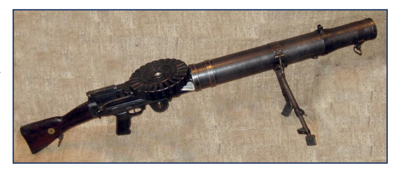
Above: A Lewis Gun

'Those who joined a Lewis machine gun team were given a 'LG' badge to wear on a sleeve. To those in the trenches the badge was nicknamed the 'suicide badge' as it was believed by the infantry that if the Germans captured you, you would be shot out of hand because of the terrible casualties caused by the Lewis