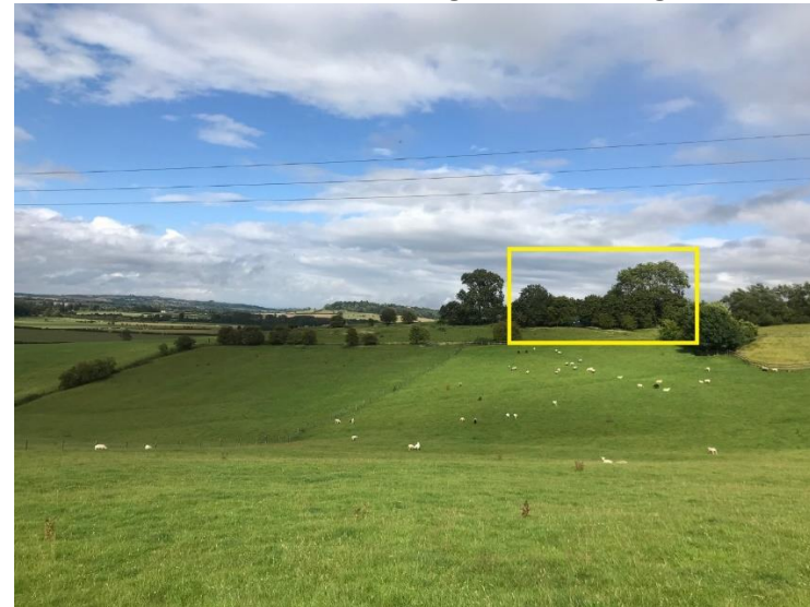
Current View With Tree and Hedgerow Screening