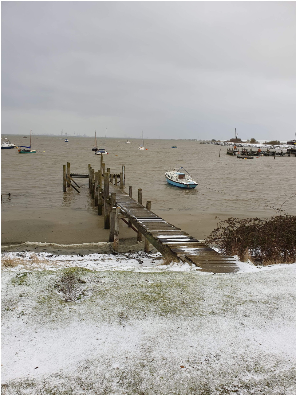
Wintery view from the Sea Wall

Compiled, edited and published for the village on behalf of St Margaret's Church