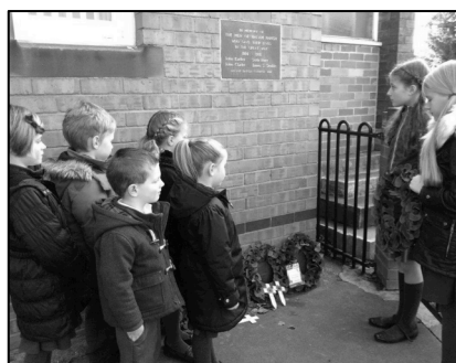
Children from Halam Primary School who attended the service of remembrance, on Sunday November 13 th in Halam church laid wreaths at the memorial plaque at the school.