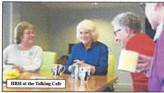
HRH at the Talking Cafe