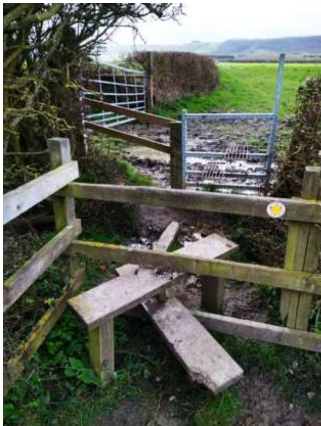
Footpath 387/19 - Stiles 4 and 5