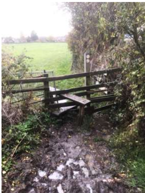
Footpath 387/19 - Stile 2