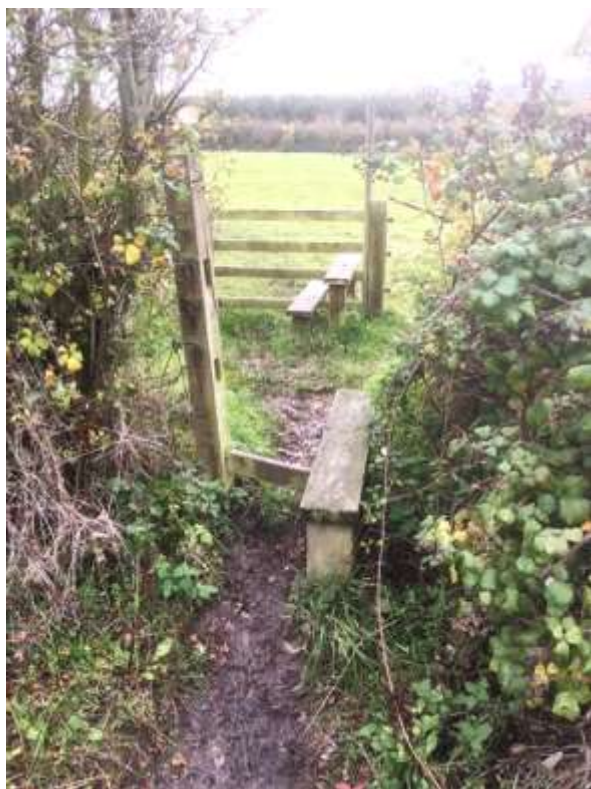
Footpath 387/19 - Stiles 8 and 9