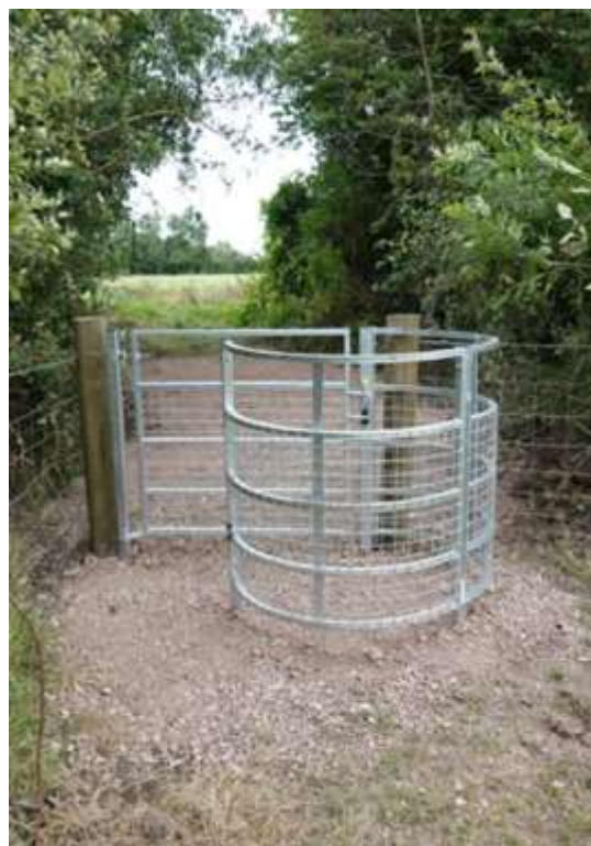
Replaced by kissing gate 2