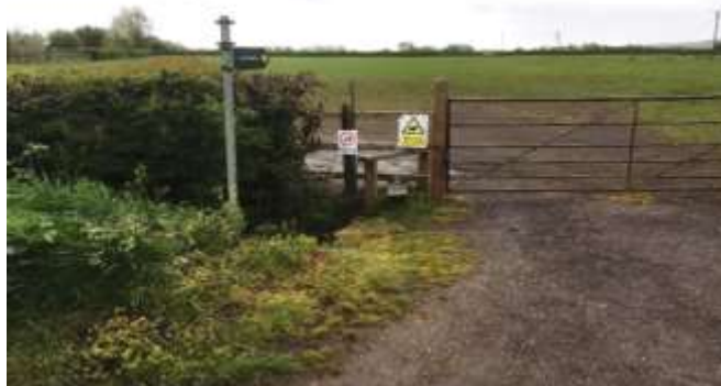
Footpath 387/18 - Stile 11