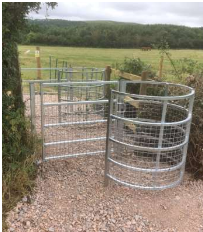
Replaced by kissing gates 8 and 9