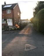
Opposite entry to garages behind Forge Cottages