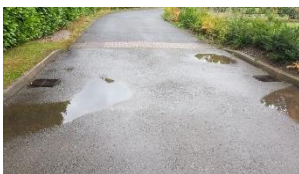
Junction with Bathley Lane