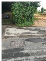
St Wilfred's Church