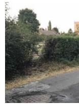
Opposite Little Orchard