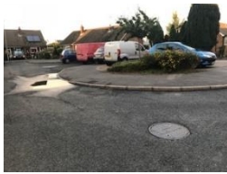
Forge Close (top end)