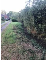
Dyke opposite Rosegarth