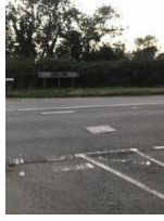
Church Lane junction with Great North Road