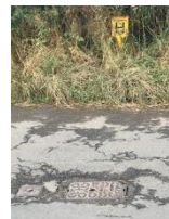
Before Level Crossing