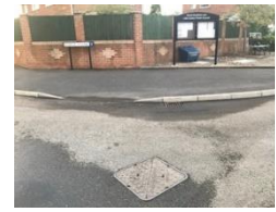
Forge Close/ Main Street