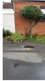
41 paces (from LP4)