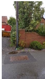
Telegraph Pole DP660