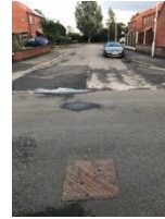
Orchard Close/ Main Street