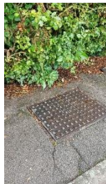
11 paces (from LP3)