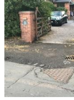
Old School House