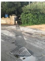
St Wilfred's Church