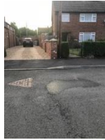
Forge Cottage (Nbr 2)