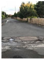
Church Lane junction with Main Street