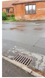
Grange Farm Bungalows