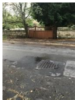
St Wilfred's House