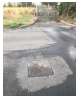
Opposite Pumping Station