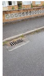
Alfresco (from LP2)