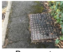
Pavement opposite Broombriggs