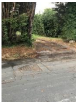
Off-shoot from Church Lane opposite Rosegarth