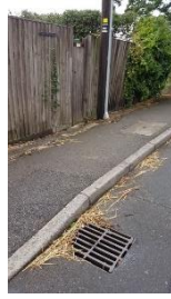
Telegraph Pole DP977