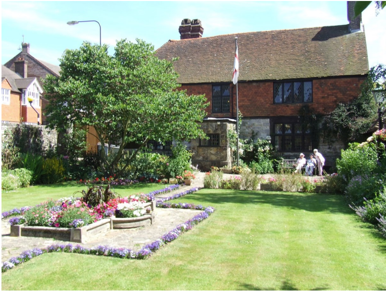
The Almonry Gardens and Exterior

for all and to support the town's post - COVID-19 recovery through tourism were agreed: