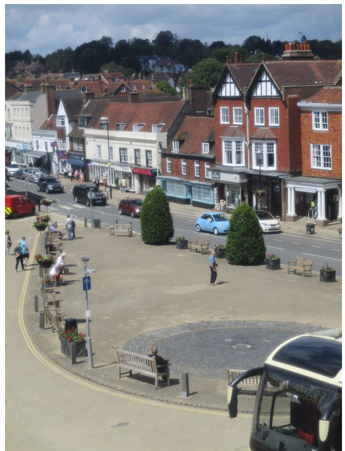
The Abbey Green and Highstreet

In addition a very big thank you to Jempson's, and the Co op for their generosity to the Food bank and the Summer Holiday Food Project, their discounts and donations enabled us to provide treats as well as basics for families to offer their children lunches during the school holidays. What a fabulous community we live in.