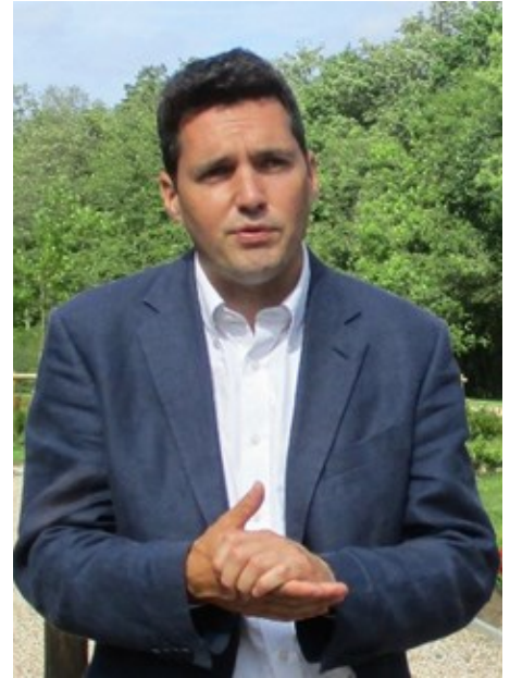
MP Huw Merriman

It has been great to spend part of my August out of Parliament visiting our local businesses and organisations. Doing so on my bike has allowed me to also view our stunning countryside (and its range of hills). The Covid-19 pandemic has been an enormous challenge for the entire community. For those whose livelihood depends on trade and custom, this has not just been a health concern but a risk to economic survival. Most who I visited were optimistic that they would see this challenge through. Many have had to adapt in order to reopen. English Heritage are a good example of change. Moving to timed bookings has had the welcome knock-on effect of waiting time being spent by visitors on the High Street. During the pandemic we have relied on our local shops and businesses to keep us going. I hope, as we return to normality, that we will remember that it's only if we shop local at all times that we will be able to rely on local in the emergency times.