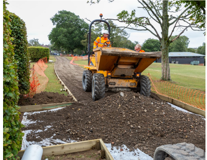
Battle Health Pathway Works

Please keep posted for more updates on the works as we all eagerly await the completion of this fantastic new asset to the town by signing up to email alerts from the Battle Town Council website at www.battletowncouncil.gov.uk .