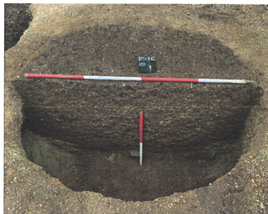
Iron Age storage pit. Vertical scale- 1m, Horizontal scale- 2m

An Iron Age storage pit excavated at this site. When grain is placed in these pits and sealed, the accumulation of carbon dioxide given off by initial germination of the grain around the pit sides halts further germination and kills off insects. This, combined with the low temperatures of underground storage is an efficient way of storing grain.