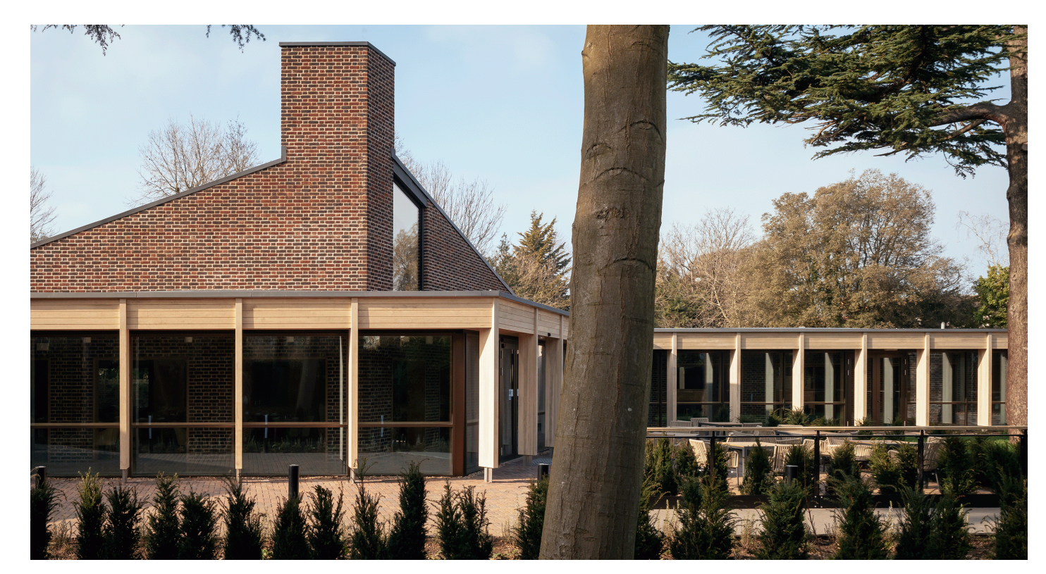
Brickwork with unifying timber 'framework'