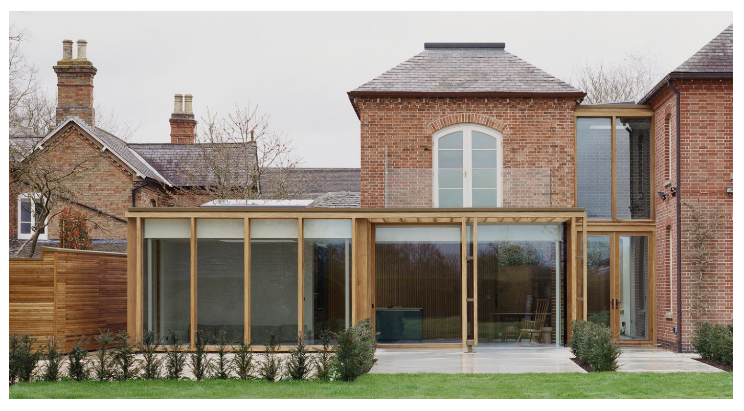
Historic brick with modern timber framework