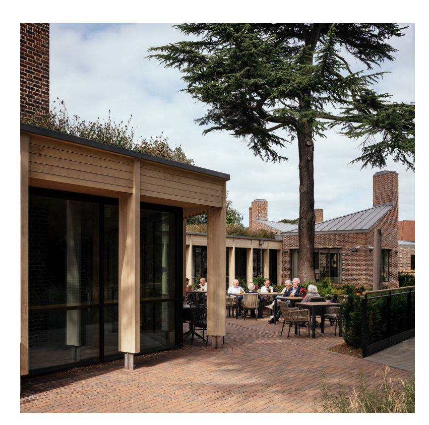
Brickwork with timber 'framework'