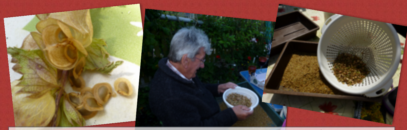
Local people worked really hard to sort the yellow rattle seed ready for sowing

ahead at what is in store for the rest of the year. We will be starting our working parties again throughout the autumn and winter. There is a lot to do, last winter was too wet and the summer has been too hot for many working parties to take place. So please start looking at the poster on the main gate for the next working party.