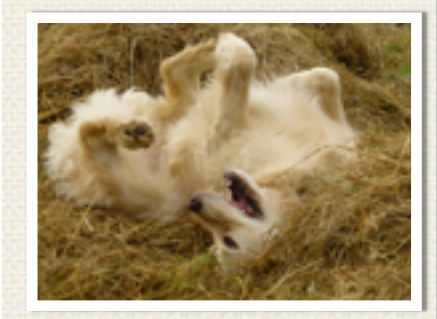
DOGS LOVED THE HAY