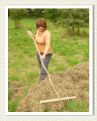
HAND CRAFTED RAKE MADE BY A LOCAL RESIDENT. HANDLE MADE FROM A BRANCH FROM THE HILL