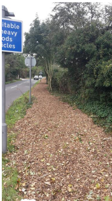
Sheepridge Lane – extended Green Path

Little Marlow Parish Council would like to thank Wycombe District Council for their financial assistance which enabled these two paths to be completed and the Rebellion Brewery for making a contribution to the maintenance of the C100 Green Path.