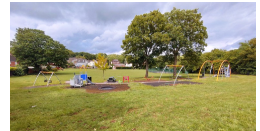
The Lower Rec will be transformed on Saturday 8 August for Hallingbury

This year's Hallingbury will be held on Saturday 8 August at the Lower Rec and has been expanded to include five bands. There will also be three bars, numerous food outlets, stalls and bouncy castles for children.