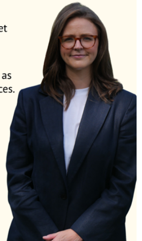
Lauren Edwards MP for Rochester and Strood

If you need help, are unsure where to turn, or want to share your views, please do get in touch. My contact details are below, and my office will always do its best to help.