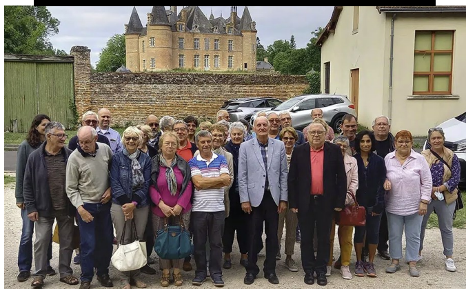
Members of Dymchurch and Salbris Twinning Association on a visit to a privately owned chateau kindly arranged by the Mayor of Salbris

2023 will mark 41 years since Salbris in France first established a link with Dymchurch, initially via our two fire brigades, before being formalised into The Twinning Association we know today. Twinning aims to develop cultural, tourist, economic and social relations with exchanges between the two towns, occurring twice a year. In 2022 Dymchurch members were able to visit Salbris once more for a long weekend and as always, enjoyed a wonderful time visiting Châteaux, enjoying all the delights of French cuisine and the hospitality of our individual hosts.