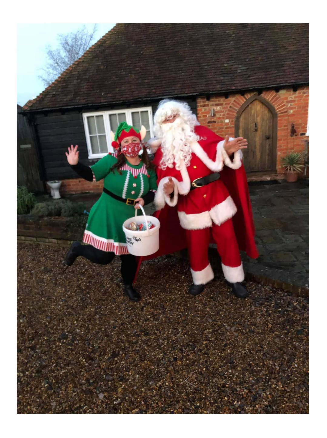
Christmas Fun in 2020