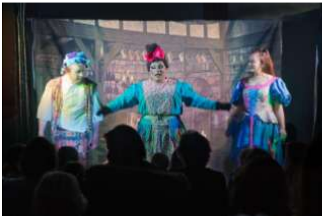
Some photos taken at the Panto held at Grafty Green Village Hall on Saturday 25 th January 2020