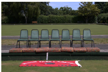
Waiting for you to turn up

Portsmouth & District Womens Bowls Association County (BH) National