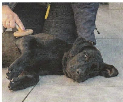
A bit of TLC