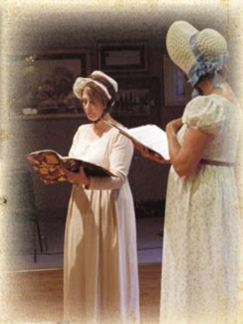
Evening of Drama & Music