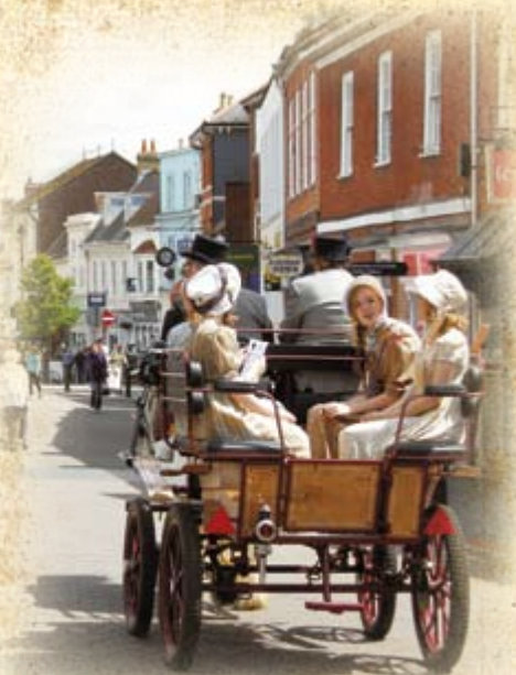
Regency Day carriage rides