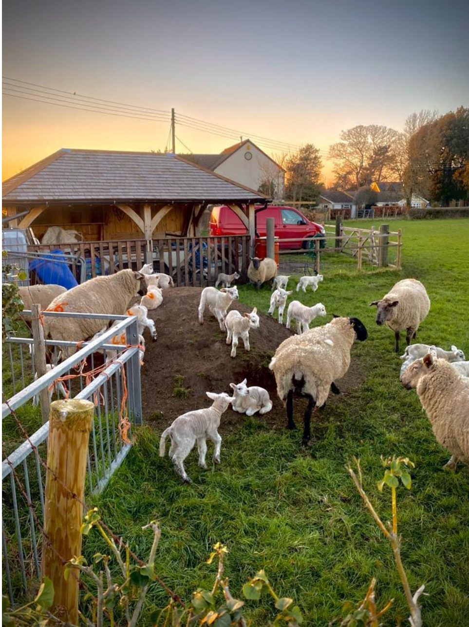
Lambs at Elm Farm