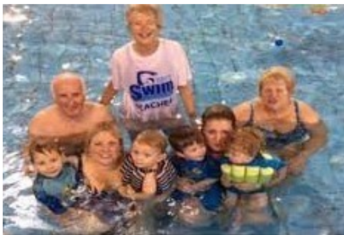
Recognise any faces here ?!!