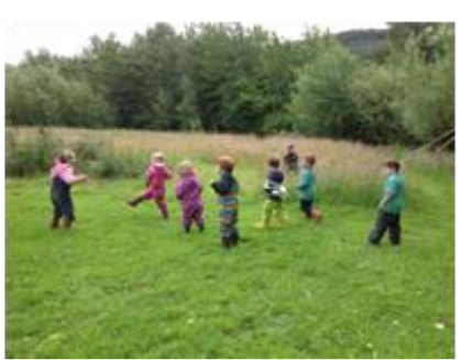
Forest School musical statues!