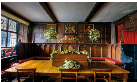
The Court Room at the Guildhall