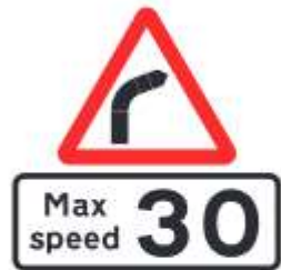
Maximum speed advised, in miles per hour, at a bend (the plate may be used with other warning signs)