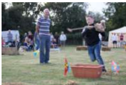
Winner of the Hobby Horse Gymkhana