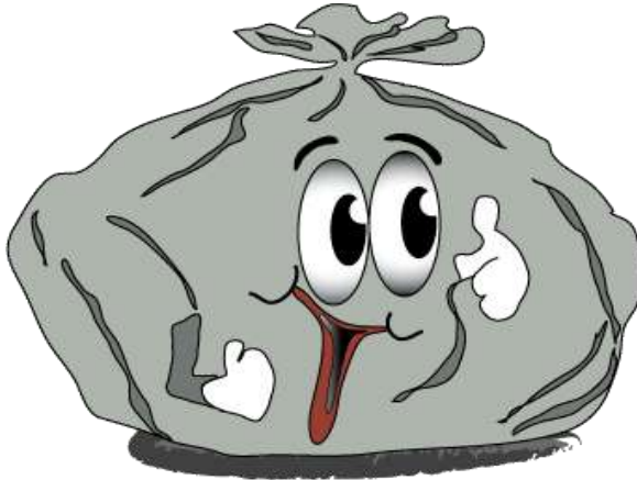
Phil The Bag TM

Don't forget our ' Phil-The-Bag ' collection on Sunday 8 th October between 10.30 and 12.00, when you are invited to bring to the Hall your old clothes, towels, bed linen, curtains, shoes, belts and bags and enjoy a convivial cuppa with us. The items, which should be placed in a bin liner, cannot include pillows and duvets, nor heavily soiled items or fabric off-cuts, I'm afraid.