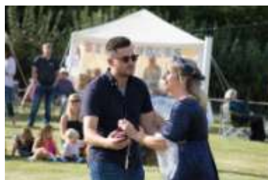
Winner of the Jousting