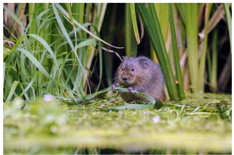
A water vole amongst reeds

Despite their name, water voles are not particularly well-adapted to aquatic life. They've evolved to live alongside water and their characteristic 'plop' is the sound of them diving into water to escape predators and access the underwater entrance to their burrow. But they are clumsy swimmers and lack rudder-like tails or webbed feet that other water-loving creatures have evolved.