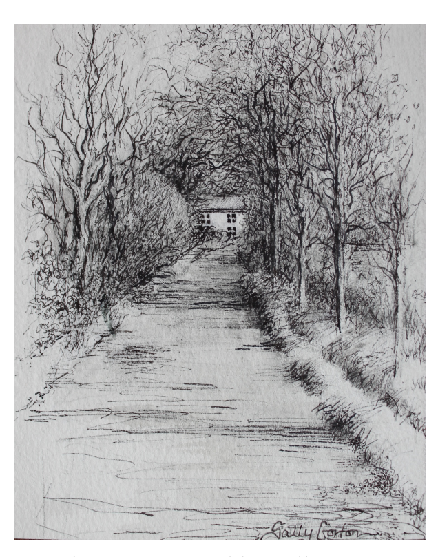
Stakescorner Road by Sally Gorton. An enclosure road created by the act of 1803.

One of the effects of having separate enclosure acts and awards for adjacent parishes is the apparent lack of co-ordination of road plans. This