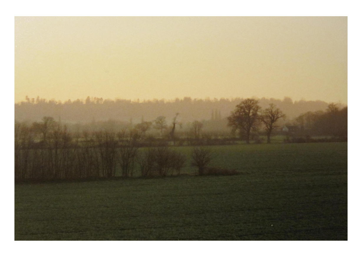
The enclosed marsh viewed from the Old Portsmouth Road railway bridge near Peasmarsh.

Standard trees, notably oak, were also planted at regular intervals along the hedges in order to provide a regular crop of large sized timber. These trees, now no longer harvested and replaced, can still be seen in the hedges along New Pond Road.