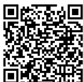
Parish Council Website