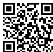
Facebook Staplehurst Parish Council