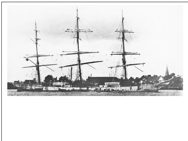
Queen Elizabeth At Rest