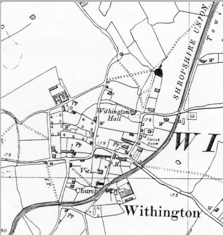
Detail of 1902 Map of Withington

Although Withington is a more affluent community than in the 1960s it still retains its village pattern developed around a green central field; this is clearly seen on aerial photos. From the 1960s onwards there were gains and losses in terms of rural life. On the retirement of the last vicar of Withington the parish was joined to the parish of Upton Magna, then to Uffington and is now part of a team ministry. Although these changes work well, it has meant several adjustments for longer stay residents. In 1982 the shop and post office closed and there have been problems maintaining a bus service to