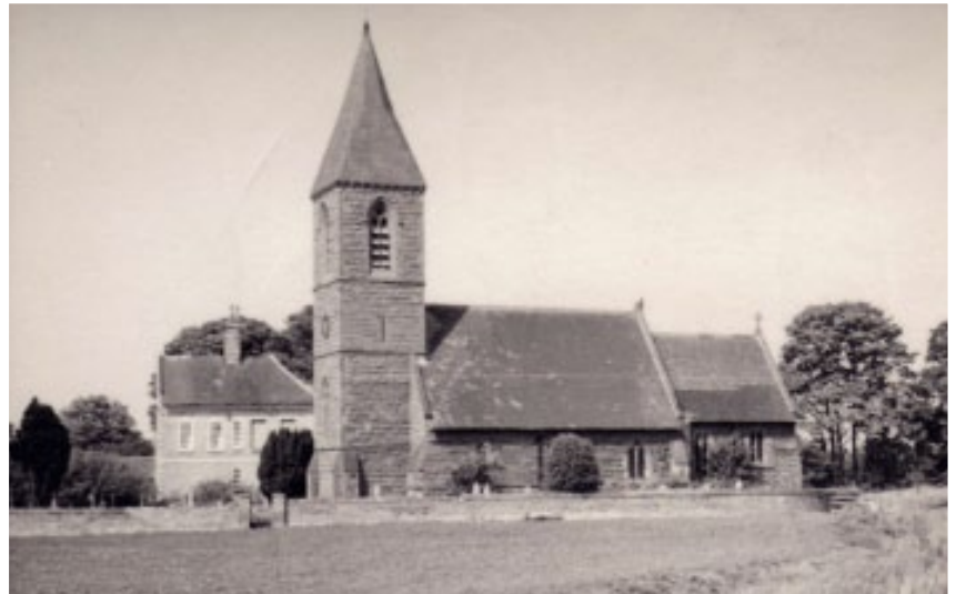
View towards Withington Church and The Old Hall

The population had become rather elderly, children moved away out of agriculture and, as houses came up for sale, they were bought by people who wanted to live in the country and had the means to modernise them. At the same time agricultural changes meant