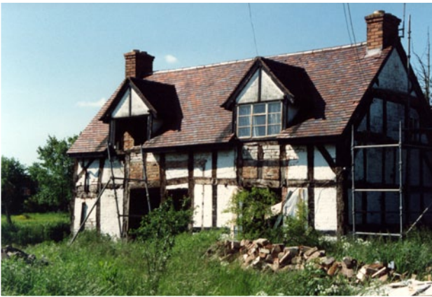
Garden Cottage, 1987