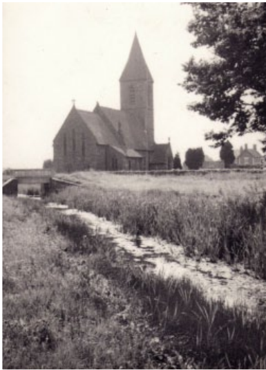
Withington Church with Canal in the foreground