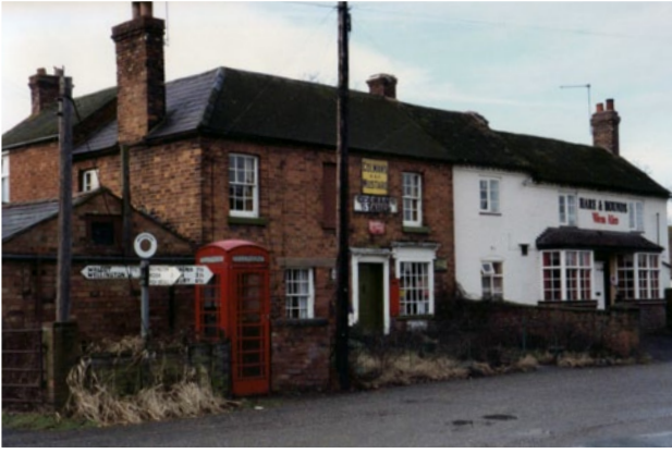
The Village Post Office and stores, Hare & Hounds pub, 1981