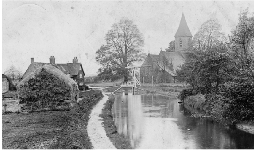
Postcard of the canal at Withington c.1908