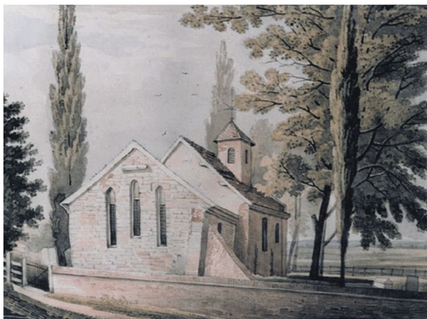
A watercolour of St John the Baptist Church, Withington, October 13 1790

The population of the village was 91 conforming Anglicans over 16 in 1676. That does not allow for any children or members of other denominations but there would have been few of them. Little remains of these times but scattered around the village are eight half timbered houses, most now beautifully restored and extended, which would have been in existence then. That they have survived and others have been demolished which were in better condition is one of the accidents of