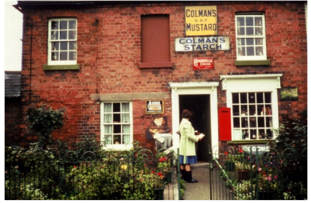
The Village Post Office and stores, 1981