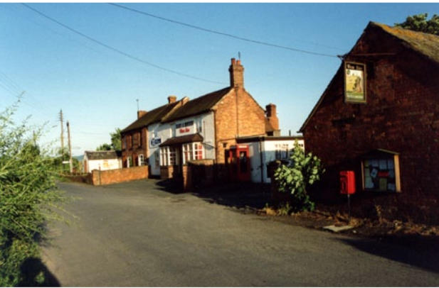
Withington, Hare & Hounds, 1987