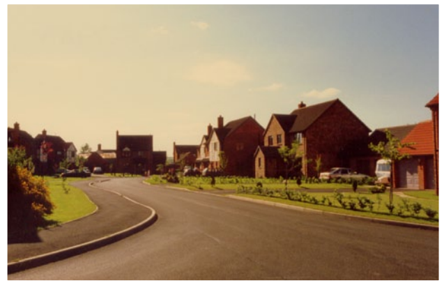
Woodlands Close, 1987