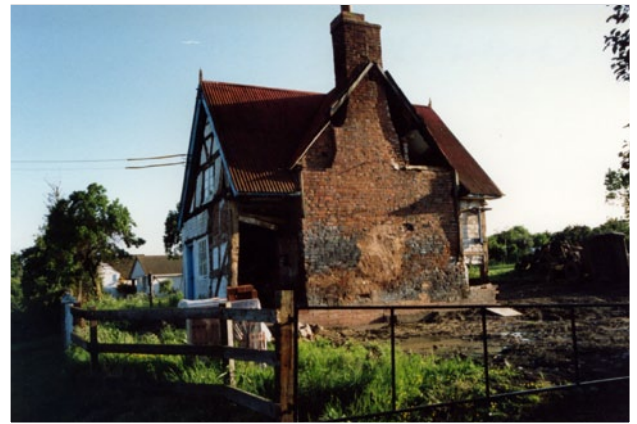
Cooper's Cottage, 1987

both Shrewsbury and Telford. However newer residents continue to give new life to the church and take leading roles in it and the wider community through the Parish Council and local societies. They have helped to keep the school open at Upton Magna.