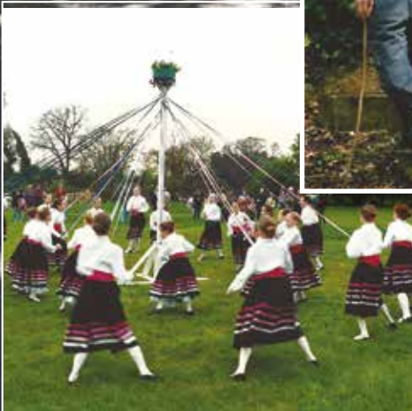
Revival of Maypole dancing