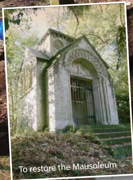
To restore the Mausoleum