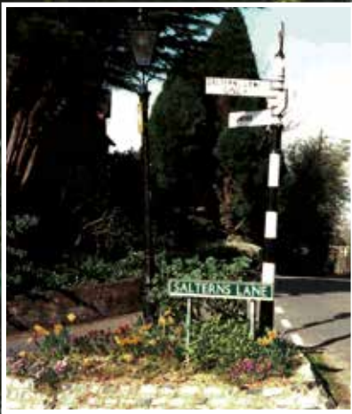
Finger posts at the top of Salterns Lane