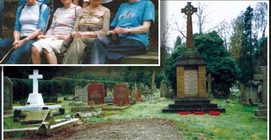
Enhancement of Bursledon's burial grounds