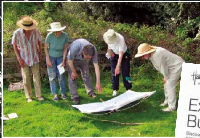
Visits to Hackett's Marsh SSSI