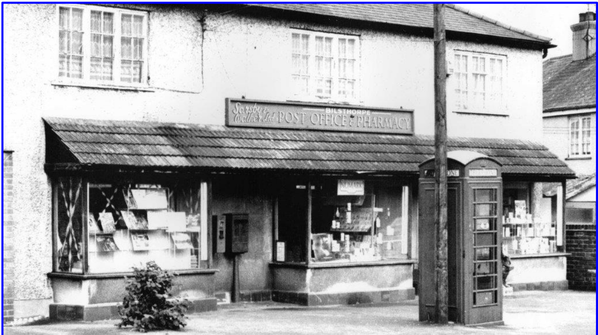
Bilsthorpe Chemist and Post Office in the 1950s