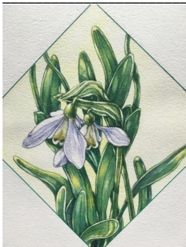
First signs of Spring, by Olga Vikhireva

Please refer to Museum web site for opening times